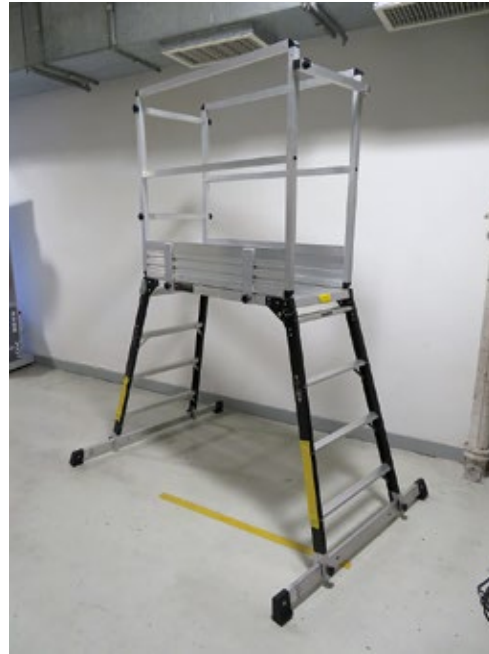
Figure 4: Hop-up platform