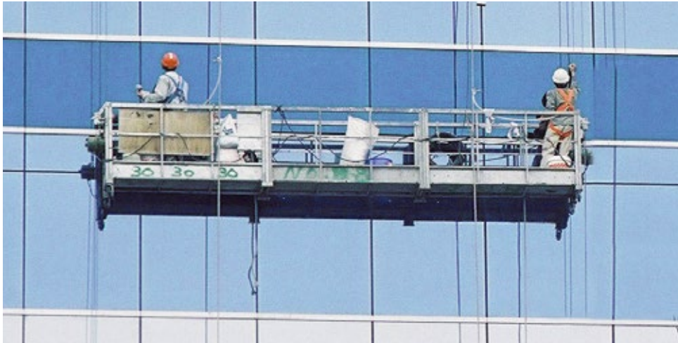
Figure 13: Suspended working platform

5.6.1 Safety precautions on the use of suspended working platforms (see Figure 13):