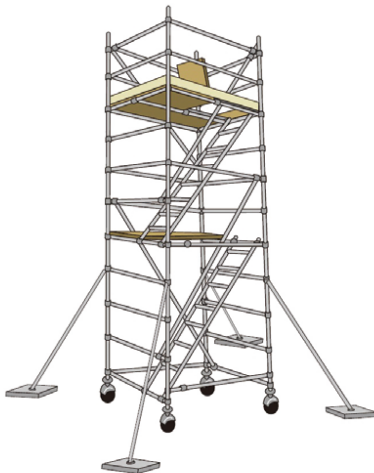
Figure 10: Mobile metal tower