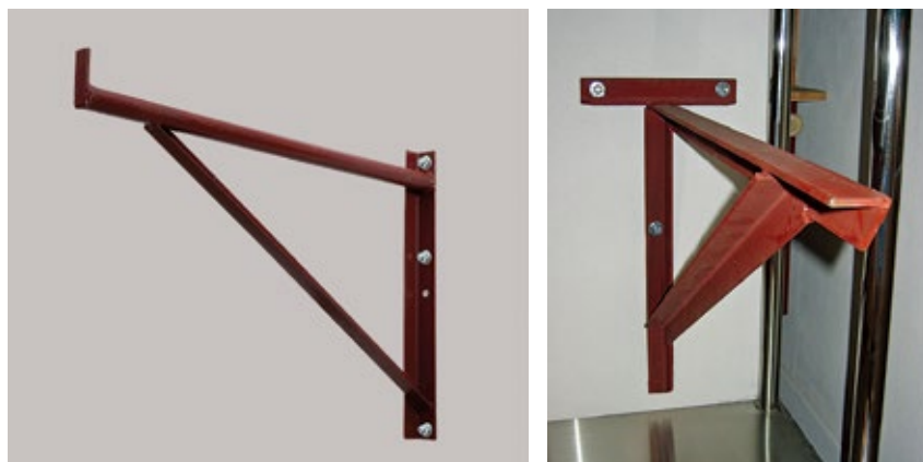
Figure 12: I-shaped metal bracket and T-shaped metal bracket