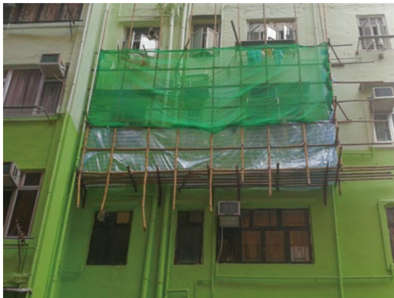
Figure 11: Truss-out bamboo scaffold

5.5.1 Truss-out bamboo scaffolds (see Figure 11) are a type of bamboo scaffold. They usually appear in single lift truss-out form and are supported by a scaffold structure/metal brackets, such as a truss-out structure projecting from the facade of a building/structure. The whole scaffold is totally dependent upon the existing building/structure for support.