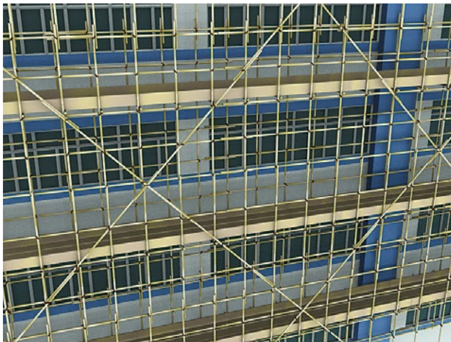
Figure 8: Three consecutive layers of working platforms