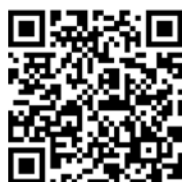
Publications and Media - Occupational Safety

This Overview is issued free of charge and can be obtained from the offices of the Occupational Safety and Health Branch or downloaded from the Labour Department's website at https://www.labour.gov.hk/eng/public/content2_8.htm . For enquiries on addresses and telephone numbers of the offices, please visit the Labour Department's website at https://www.labour.gov.hk/eng/tele/osh.htm or call 2559 2297.