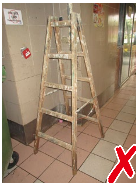
Figure 1: Unsafe ladder

4.1.2 Ladders, including straight ladders and folding ladders, are usually used for ascending and descending purposes only. It is unsafe to use such ladders for work purpose (Figure 1). In the past, many accidents involving serious injuries or deaths were caused by workers using ladders for work-above-ground/work-at-height. Even when the work is carried out at a place not so high above the ground, the risks involved must not be overlooked. Therefore, ladders 1,2 should not be used whenever feasible.