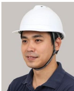
Figure 17: Safety helmet with a chin strap

6.3.1 In addition to the above safety measures, contractors and employers should provide safety helmets with chin straps (commonly known as “helmet straps”) (see Figure 17) to workers to strengthen work-above-ground/work-at-height safety, and ensure that they are properly used at work so as to prevent the helmets from accidental displacement or loosening and loss of head protection when workers fall from height.