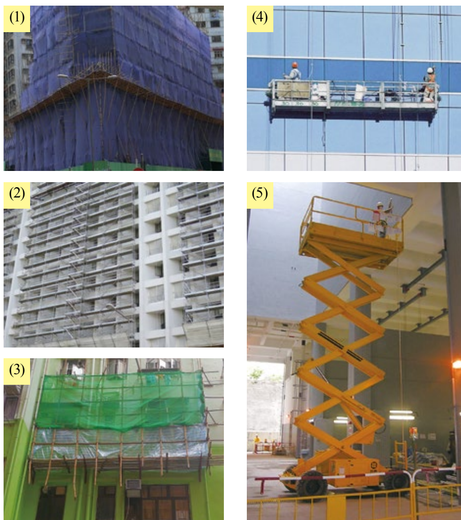
Figure 5: Different types of working platforms