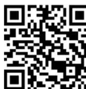
Addresses and Telephone Numbers of the Offices

This Overview may be freely reproduced except for advertising, endorsement or commercial purposes. For extracts of information, please acknowledge the source as “Overview of Work-at-Height Safety” published by the Labour Department.