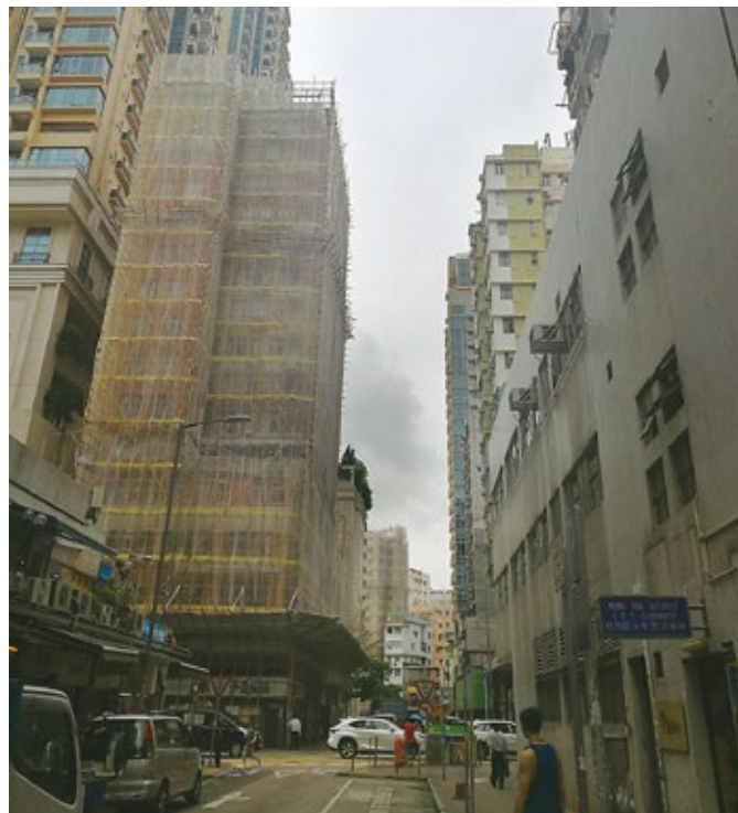
Figure 6: Double-row bamboo scaffold for building maintenance works

5.3.1 The erection of bamboo scaffolds (see Figure 6) should conform to the requirements provided in the “Code of Practice for Bamboo Scaffolding Safety” and “Safety Guide for Bamboo Scaffolding Work”, including the following arrangements and safety responsibilities: