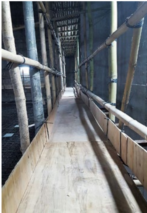
Figure 7: Closely spaced bamboo scaffold