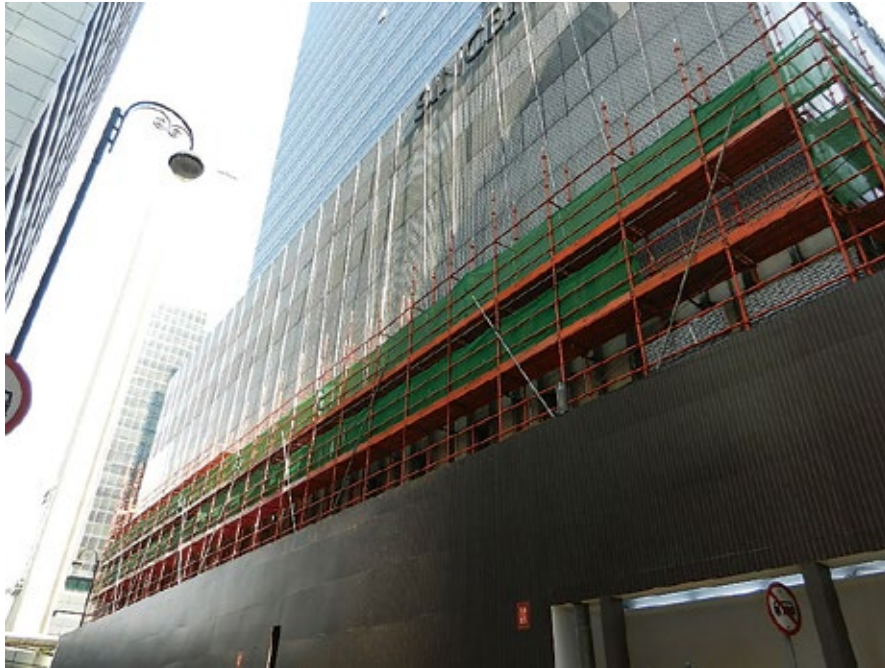
Figure 9: Independent tied metal scaffold