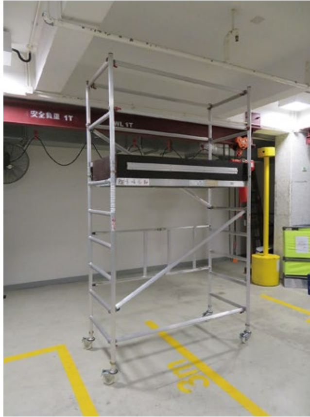
Figure 2: Mobile working platform

4.2.1 The following mobile working platform is commonly used for work at less than 2 metres above the ground (Figure 2).