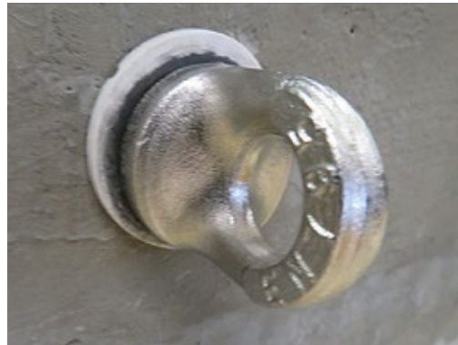
Figure 15: Full body safety harness attached to an independent anchorage