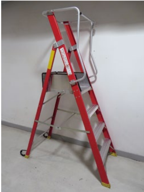
Figure 3: Step platform