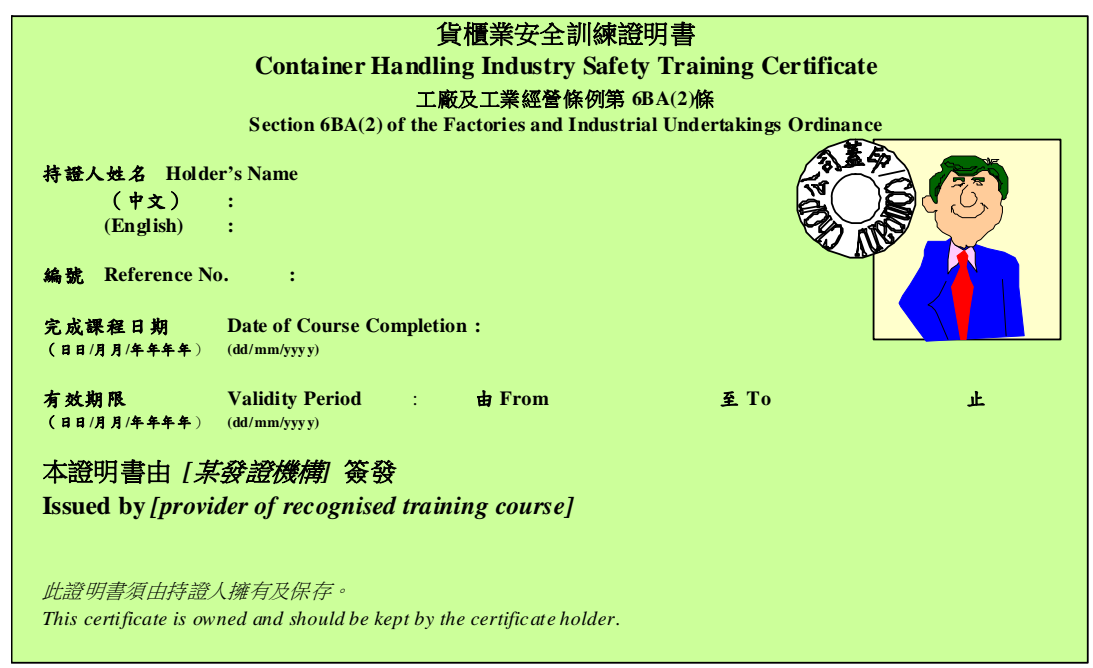
(not to scale)