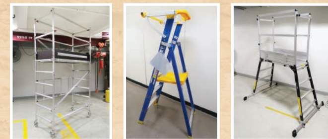
Mobile working platform