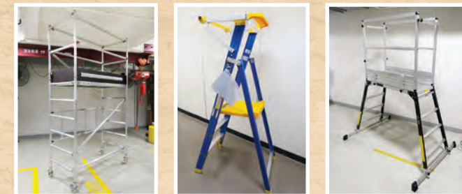
Mobile working platform