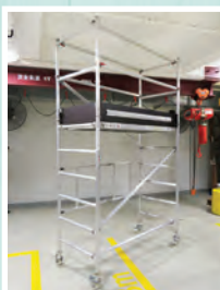
Mobile working platform