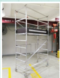
Mobile working platform