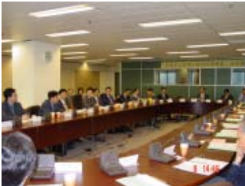
(左) (left) 与会者积极参与。 Attendees participating actively.

A discussion forum on “Creation of employment through development of local community economy” was held on 9 May 2002. This event aimed to provide a forum for exchange of views concerning the development of the local community economy under the current economic and employment situation among academics and members of the LAB and its Committees. Potential areas for development were identified for the creation of employment opportunities.