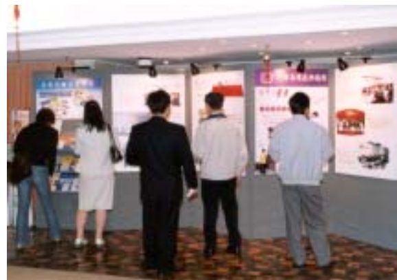
展览会上介绍及展示劳工处在2001年编印的刊物。 New publications of the department in 2001 was introduced and displayed.