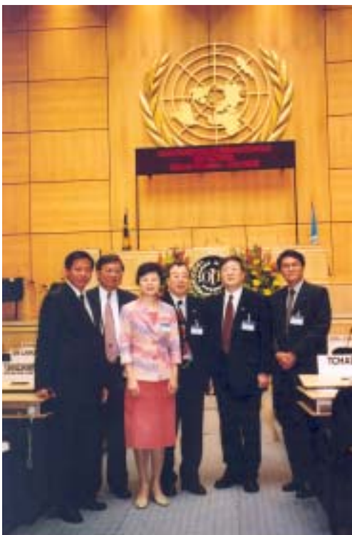
代表团出席第 90 届国际劳工大会。 The delegation team attending the 90 th International Labour Conference.

香港特区代表团的成员出席大会全体会议，并参与标准实施委员会、促进合作社委员会、职业事故和职业病委员会，以及非正规经济委员会等。 The HKSAR representatives attended the plenary sessions of the Conference and meetings of the Committee on Application of Standards, Committee on Promotion of Cooperatives, Committee on Occupational Accidents and Diseases and Committee on Informal Economy, etc.