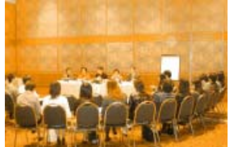
与会者就三项试点计划进行分组讨论。 (右) Participants discussing on three pilot projects in groups.