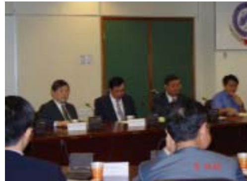
(右) (right) 劳顾会委员参与座谈会。 LAB Members attending the forum.