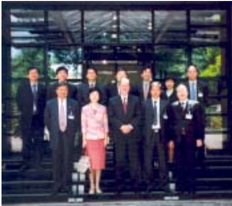
代表团与香港驻日内瓦经济贸易办事处官员合照。 The delegation team pictured with officials from the Geneva Office, Hong Kong Economic and Trade Office.