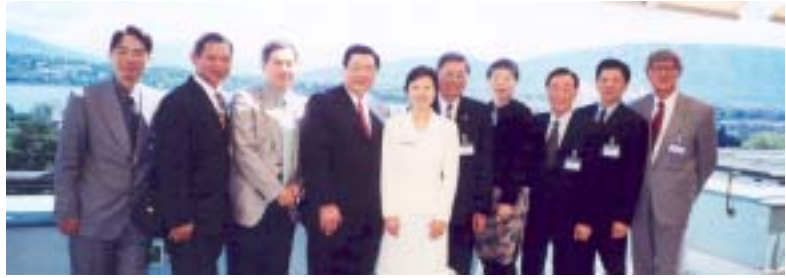
第89届国际劳工大会香港特区代表团与澳门特区代表会面。 Representatives of the HKSAR of the 89 th International Labour Conference met with representatives of the Macau SAR.

The Vice Minister of the Ministry of Labour and Social Security of China, Mr Li Qiyan (1 st from front row) and the chairman of the LAB/Commissioner for Labour, Mrs Pamela Tan, attending the 89 th Session of the International Labour Conference.