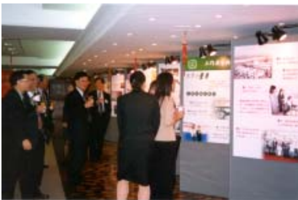
小型展览会的主题是：「劳工处在2001年举办的主要活动及事件」 The theme of the mini-exhibition was "Highlights of major activities and events of the Labour Department in 2001".

To enable guests to have a better understanding of the latest services, activities and publications of the department, a mini-exhibition was also staged during the LD cum LAB Spring Reception 2002 to highlight the major events, activities and publications of the department in 2001.