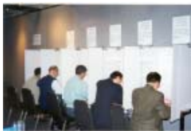
投票人士在投票间投票。 Voters marking their choices at the voting compartment.