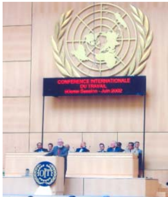
国际劳工局局长胡安·索马维亚在第 90 届国际劳工大会上致辞。 The Director-General of the International Labour Office, Mr Juan Somavia, delivering his speech at the 90 th International Labour Conference.