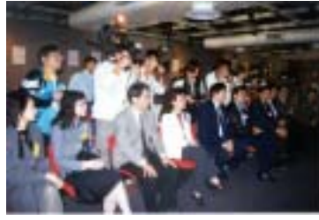
候选人等候选举结果。 Candidates waiting for the election results.