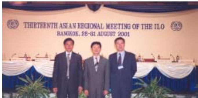
香港代表团的成员。 Members of the tripartite team from the HKSAR.