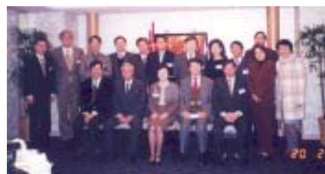
劳顾会委员到日本劳动研究机构访问。 The LAB visiting the Japan Institute of Labour.