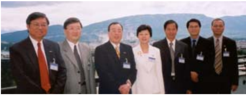
第 90 届国际劳工大会香港特区代表团成员。 Representatives of the HKSAR of the 90 th International Labour Conference.

这次会议共有超过三千名来自国际劳工组织大部份成员国的政府、雇主和雇员代表及顾问参加。 The Conference was attended by over 3 000 government, employer and employee delegates and advisers from most of the member States of the ILO.