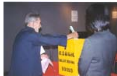
一名投票人士将选票放入投票箱。 A voter putting the ballot paper into the ballot box.