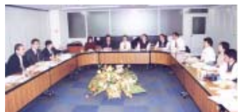
会议进行中。 Meeting in progress.