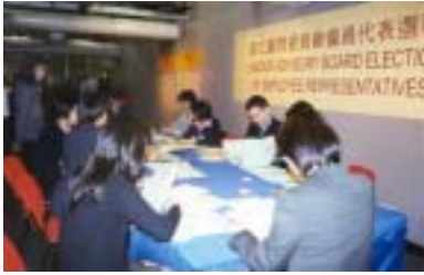
劳工处的职员点算有关选票。 Officers of the Labour Department counting the votes.