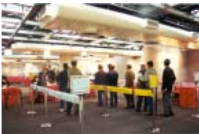
投票人士等候办理登记手续。 Voters waiting for registration.

The remaining two Members, one representing employers and the other representing employees, were appointed by the government ad personam . The appointment of the 12 Members was published in the Government Gazette. The LAB met 10 times during the period from 1 January 2001 to 31 December 2002. The membership of the LAB for the term 2001 - 2002 is on page vi.