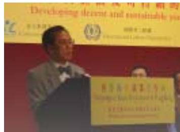
政务司司长曾荫权宣布青年就业工作坊开幕。 The Chief Secretary for Administration, Mr Donald Tsang, announcing the opening of the Youth Employment Workshop.