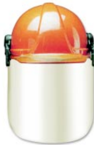
Figure E: Faceshield