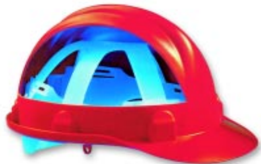
Figure B: Harness (inside the shell)