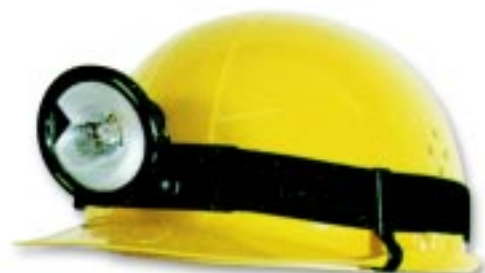
Figure G: Headlamp