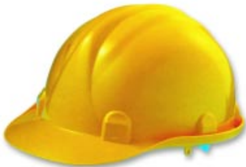
Figure A: Shell

A safety helmet consists of two primary components - shell and harness (Figures A & B).