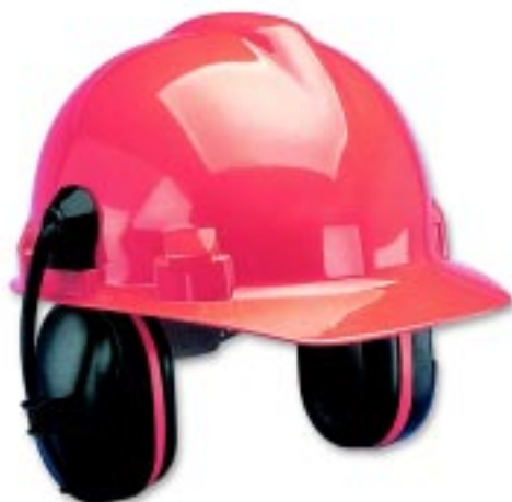
Figure F: Earmuffs