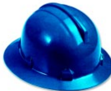
Figure I: The Hat Style