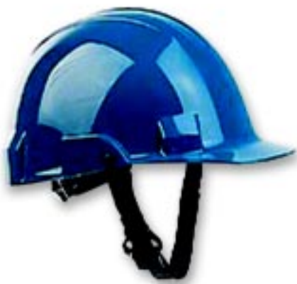
Figure D: Chin strap

There is a wide range of accessories which can be fitted to a safety helmet to make it more suitable for variable working conditions. Examples of accessories are chin strap, faceshield, earmuffs, and handlamp (Figure D to G). Care should be taken to ensure that any addition of helmet accessories and their attachment should be compatible to the helmet. Use of original manufacturer's accessories is recommended. No modification or change of existing helmets should be carried out to fit accessories unless advice from the manufacturer has been sought.