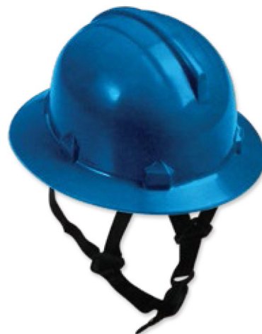
Figure H: The Hat Style