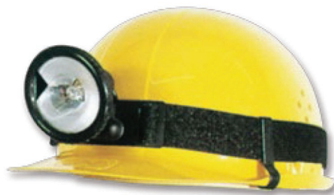
Figure F: Headlamp

(Chin straps are deliberately omitted on the safety helmets for clear demonstration of accessories.)