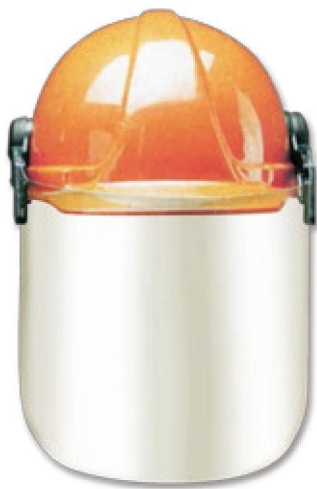
Figure D: Faceshield

There is a wide range of accessories which can be fitted to a safety helmet to make it more suitable for variable working conditions. Examples of accessories are faceshield, earmuffs, and headlamp (Figures D to F). Care should be taken to ensure that any addition of helmet accessories and their attachment should be compatible to the helmet. Use of original manufacturer's accessories is recommended. No modification or change of existing helmets should be carried out to fit accessories unless advice from the manufacturer has been sought.