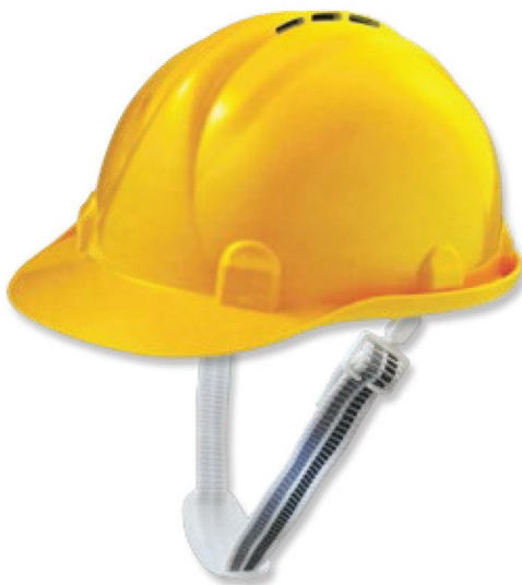
Figure A: Shell

A safety helmet consists of three primary components - (I) shell, (II) harness and (III) chin strap (Figures A & B).