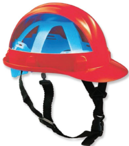
Figure B: Harness (inside the shell)