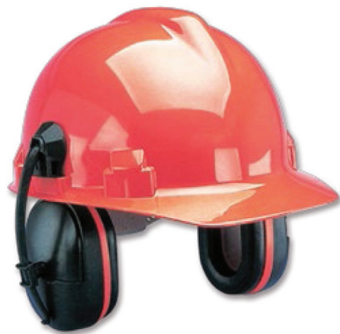
Figure E: Earmuffs