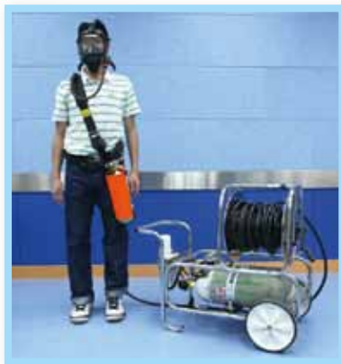
Compressed air line breathing apparatus

Air-supplying RPE provides uncontaminated air from an independent source for breathing by the user. It includes the self-contained breathing apparatus which provides air from a gas cylinder, and the compressed air line breathing apparatus which provides uncontaminated air from a source through a long hose. Misuse of this type of RPE may seriously endanger the user and, therefore, stringent precautions must be followed.