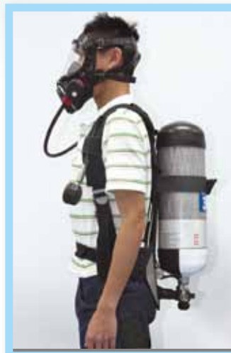
Self-contained breathing apparatus