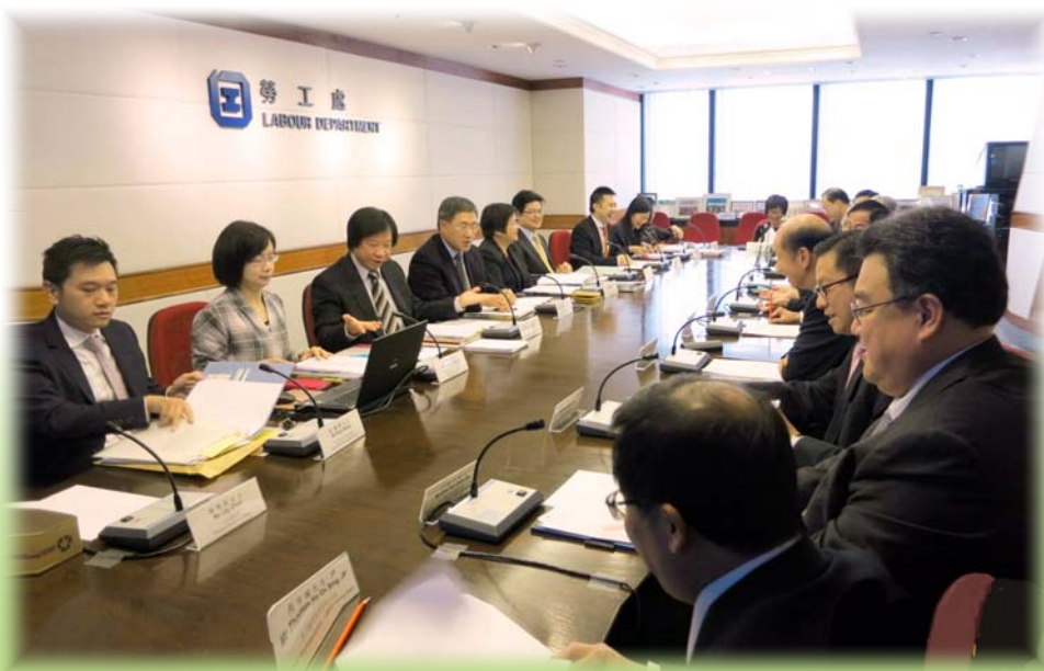
Labour Advisory Board meeting

2.16 LD consults various advisory boards and committees on labour matters. The most important one is LAB. It is a high-level and representative tripartite consultative body which gives advice on matters affecting labour, including legislation and Conventions and Recommendations of the International Labour Organisation. LAB is chaired by the Commissioner for Labour and comprises members representing employees and employers. Its terms of reference, composition and membership for 2013-2014 are in Figure 2.3 .